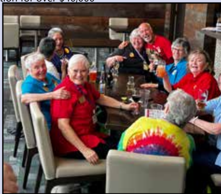
Friends gathering during a break at MD19 Convention