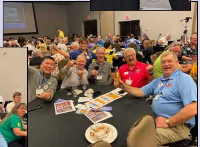
Fun photos from Fun Night!