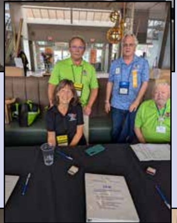
Time to vote!