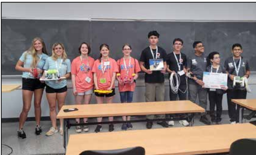
During the 2023 International SeaPerch Competition, the team met people from around the world. Shown is ECH with teams from South Carolina, California, and Egypt.