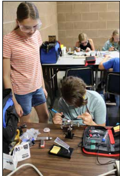
ECH-Science team member helping a middle school student at a summer SeaPerch camp.