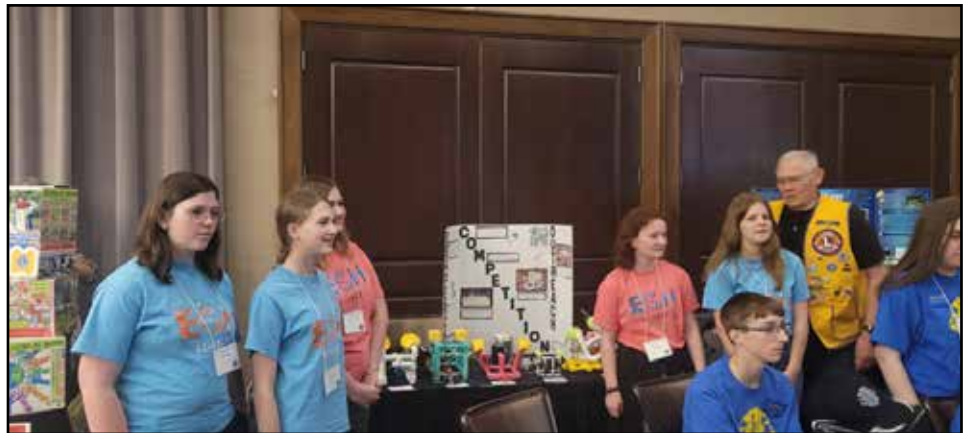
The team next to their booth at the MD-19 Conference. (Also shown are the team's 5 R.O.Vs)