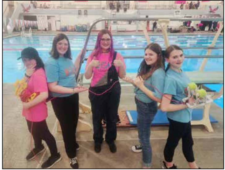
ECH Science at the North-West Regional Competition in Cheney, WA. with their R.O.V. "Frank"