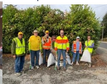
Lakewood First Lions at Work with Cleanups in Community. Note Lions hats & photos of Lions at Work”