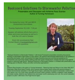
September-Stormwater/ Rain Gardens

Evening Environment Presentations. The MD19 Environment Team and the District C Environment Team are hosting mid-monthly Evening Talks on Zoom. Our goal is to reach Lions and other community members with a variety of presentations that feature Lions at Work for the environment, or information about specific environment issues. The District C Environment Team is offering Climate Summits every other month. The MD19 Team is filling in the calendar with Evening Environment Talks. Watch the MD 19 website for monthly information about date and times. https://lionsmd19.org