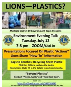
July Talk - Plastics-Three