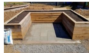
EatWell Camas Community Garden supported by Camas Lions. Notice ADA compliant Planter Station