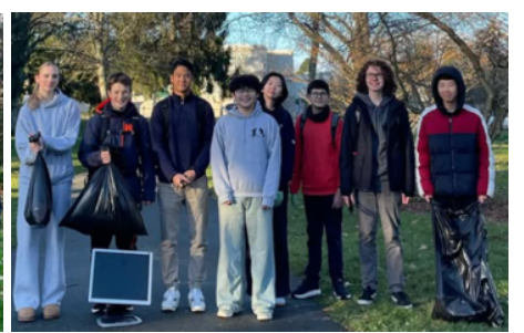
The Earl Marriott Leo Club has set a target of conducting a park clean up in the South Surrey / White Rock area each month. So far, they have held a clean up of Alderwood Park in September, Bakerview Park in October and Maccaud Park in November.