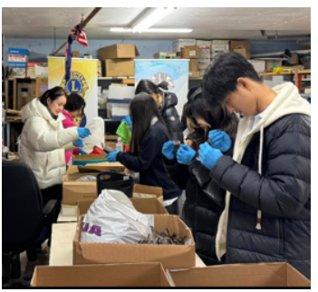
Thanks to Vancouver East Lions Club, Vancouver Pacific Lions Club, Richmond Lahoo Lions Club and Vancouver Lahoo Leo Club. Volunteering at TWECS Eye Glass Warehouse

Kamloops Brock Central Lions use wooden cutlery and compostable plates at their BBQ's & Pancake Breakfasts...Leos clean beaches.... create and maintain parks...Lions do watershed restoration....grow and distribute food...work with partners to advocate for a global plastics treaty.