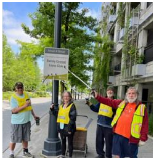
Surrey Central Lions Adopt a Road.

As the Environment Chairs circulate through our districts, speaking to Lions, scanning MyLion, Facebook pages and websites, these are some of the projects we see.