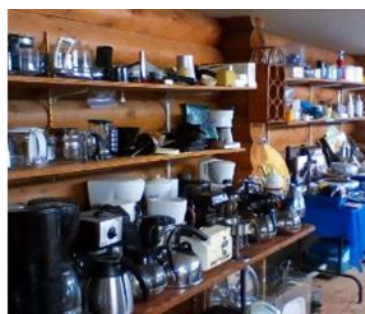
Salt Spring Lions Garage Sales.