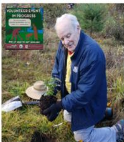
11/22/22 Lakewood First Lions plants a tree at District Environmental event at SilverCreek Park. District C Earth Day Event.