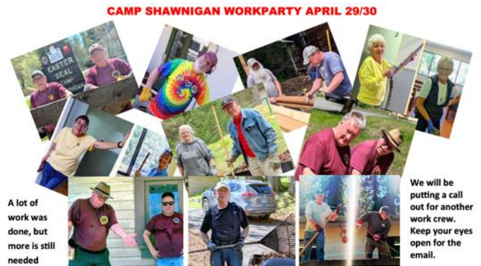
District I Lions Restore & Maintain Camp