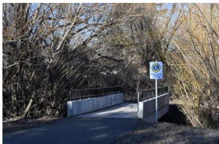
Yakima Lions helped build a bridge in Randall Park. Shown, a recently installed sign.