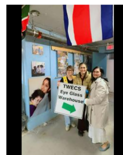
Thanks to Vancouver East, Vancouver Pacific, Richmond Lahoo Lions Clubs and Vancouver Lahoo Leo Club for volunteering at TWECS Eyeglass Warehouse.