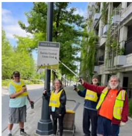
Surrey Central Lions Adopt a Road.

As the Environment Chairpersons circulate through our districts, speaking to Lions, scanning MyLion, Facebook pages and websites, these are some of the projects we see.