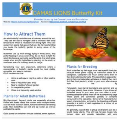
Evolved from teamwork at NW Lions Leadership Institute)