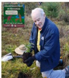
11/22/22 Lakewood First Lions plants a tree at District Environmental event at SilverCreek Park.