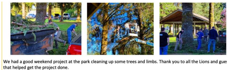
We had a good weekend project at the park cleaning up some trees and limbs. Thank you to all the Lions and guests that helped get the project done.