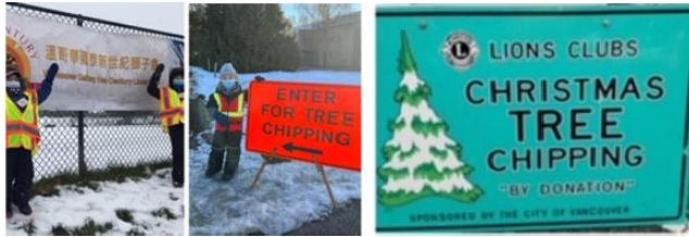
Vancouver Cathay New Century, Vancouver Templeton, & Vancouver Broadway Lions