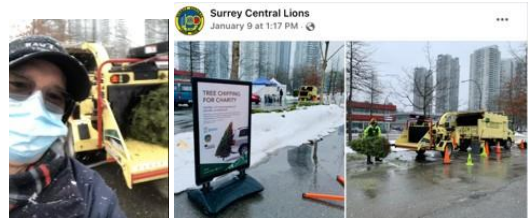
Surrey Central Lions