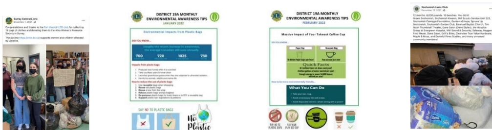
Surrey Earl Marriott Leos-Clothing Collection- Re-use. District A Monthly Tips. Snohomish Lions-8000 lbs. plastic recycled!