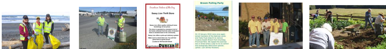
Bellingham Harborview / Lynden Lion Beach Cleanup--Nanaimo Highway Cleanup--Duncan Recycling Gabriola Island Scotch Broom Pulling--Renton Post Office Cleanup--Clallam Bay Sekiu Gardens

Seeking Information from Each District to Create an Online Databank of Multiple District 19 Environment Projects , including contact people and particulars. Please tell me what is happening in your district. I am looking for photos and information. Projects seem to fall into these categories: Tree Planting, Gardens, Beach Cleanups, Highway Cleanups, Community Cleanups, Recycling, Stream/Forest Restoration, and Parks.